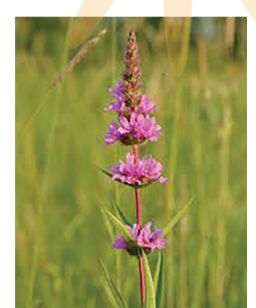
Lvthrum salicaria (Purple loosestrife)