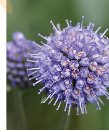
Succisa pratensis (Devil's bit scabious)