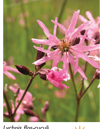
Lychnis flos-cuculi (Ragged robin)